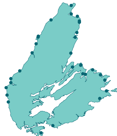
Figure 3: Small Craft Harbours in Cape Breton